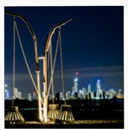
Be inspired by the Swell Sculptural Festival at Elephant Rock.