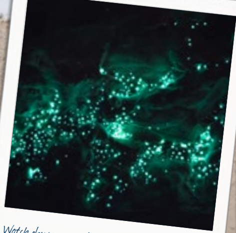
Watch glow worms light up the natural bridge cave and see the waterfalls at Springbrook National Park.