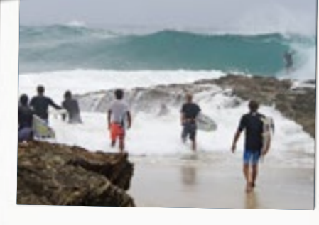
Spot the world's best surfers at the Quicksilver Pro at Snapper Rocks.