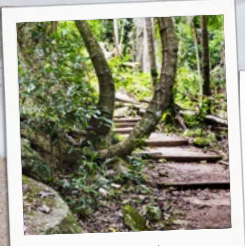
Hike Mt. Warning in the early morning to watch the sunrise.