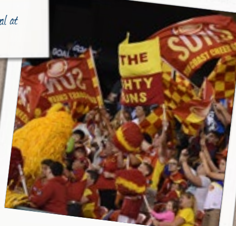
Catch a local Australian Football League match at the Gold Coast Suns Metricon Stadium.