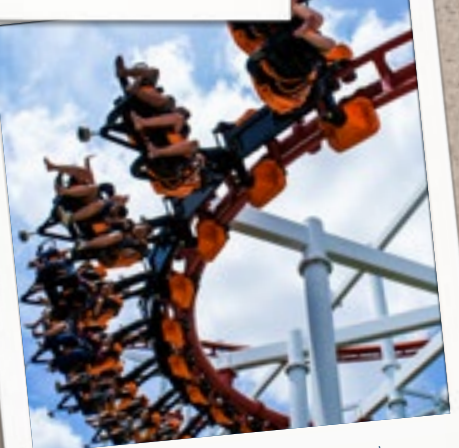
Enjoy the thrill of one of the Gold Coast's many theme or water parks.