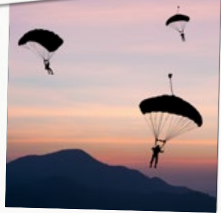
See the Gold Coast from new heights and feel the exhilaration of a beach landing Skydive experience at Coolangatta Beach.