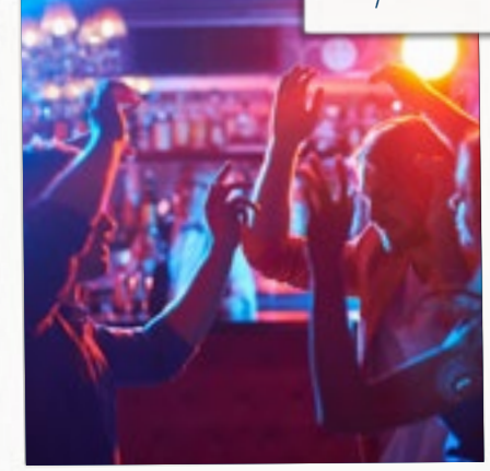
Explore the night life in Surfers Paradise.