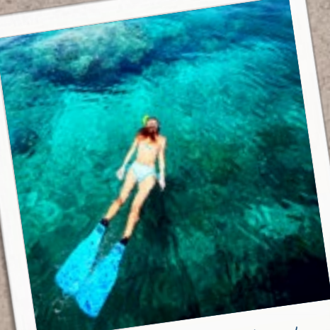
Snorkel the ship wrecks and feed dolphins at Tangalooma Resort at Moreton Island.