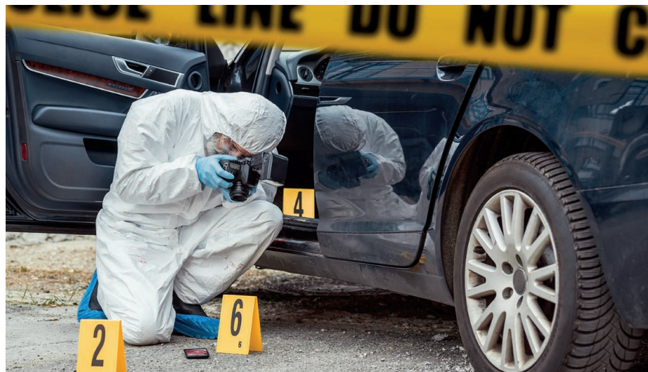
Traces of DNA from items at a crime scene can predict a person’s hair, eye, and skin color—and more, some say.