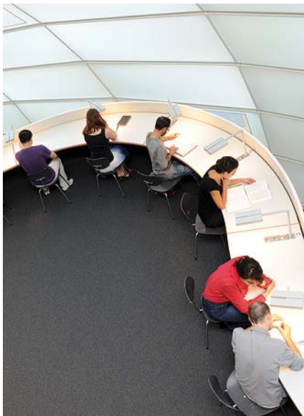
The Philological Library offers excellent study facilities for students and faculty. The library consists of 14 sub-libraries with 750,000 printed volumes.

former President of the Federal Republic of Germany, Roman Herzog; the former German Foreign Minister Hans-Dietrich Genscher; the former president of the federal constitutional courts and long-standing president of the Goethe Institute, Jutta Limbach; the former governing mayors of Berlin Eberhard Diepgen, Walter Momper, and Klaus Wowereit; and the Nobel Prize laureate in Literature, Herta Müller.