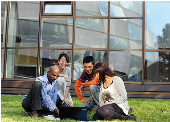
People from 130 countries come together at Freie Universität.

The foundation of Freie Universität Berlin was facilitated through international support, and international impulses have shaped its research and teaching ever since. In order to survive, both on an academic and an intellectual level, Freie Universität established connections from its geographically isolated position in West Berlin to organizations and personalities in Western Germany, Europe, and the world beyond. What began as a necessity rapidly evolved into a successful strategy: currently, Freie Universität has approximately 180 partnerships with scholarly institutions worldwide. The university is a drawing card for researchers from abroad. Freie Universität is the location in Germany most often selected for visiting scholars through the Alexander von Humboldt Foundation. A total of 30,600 students are enrolled in more than 180 subject areas. 16 percent of the students come from abroad, as do 26 percent of the doctoral students.